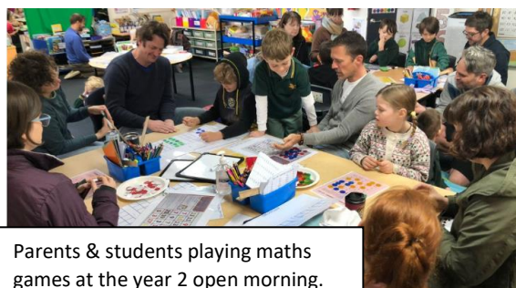
Parents & students playing maths games at the year 2 open morning.

We celebrated Education Week this year with a variety of STEM activities. I would like to thank the many people who came together to celebrate and spotlight science and technology with and for our students. Parents and staff contributed to an array of science, technology, and mathematics opportunities throughout the week and at the Super Science Night. The primary school science curriculum is broad and covers many concepts at the different year levels. At Westgarth our students participate in a unit of science for one term each year as well as our year 3 – 6 students having a dedicated Robotics/Technology specialist class each week. Talking to our students has highlighted the perception that we do not teach enough science but when we dig deeper, students often view chemical science as science and other areas of science such as biological, earth and space, and physical sciences as inquiry topics, not science. It is obvious we have some work ahead of us to change that understanding. As a mother of a mathematician and a fire ecologist, I appreciate how important it is for our students to embrace the sciences, after all our future depends on it.